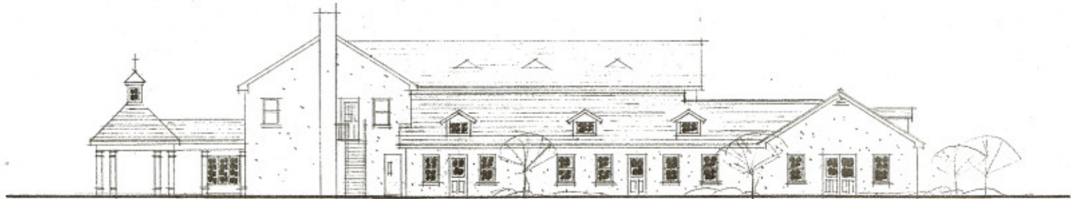
WEST ELEVATION Looking From Down in Woods

TRINITY CHURCH DAY SCHOOL • MARCH 6, 2008 • TOTAL CONSTRUCTION SERVICES INC 410-617-2000 • STAN PIZZERIA ARCHITECT FA 410-517-1478