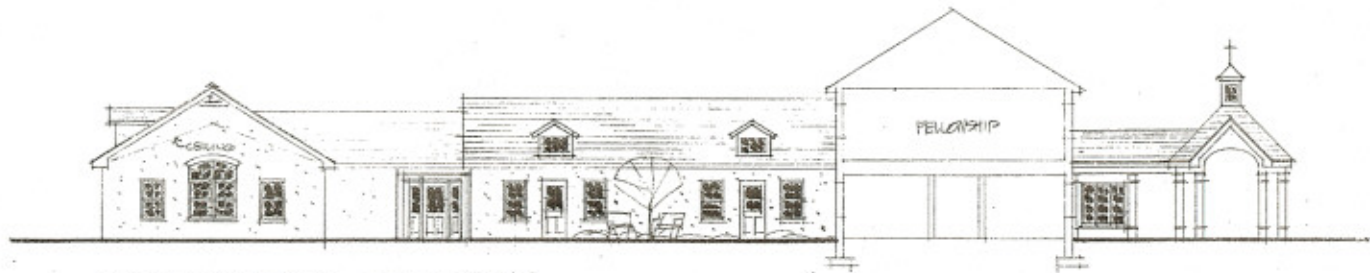
EAST ELEVATION scale 1/8"=1'0" Looking From Courtyard